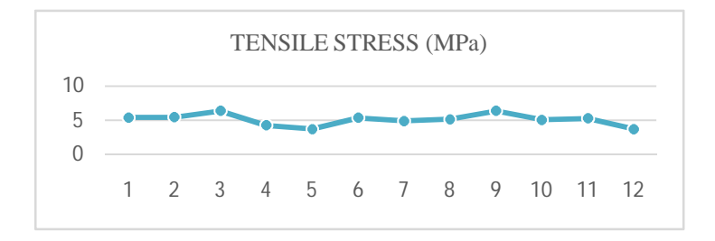
Fig. 2. Graph of specimen and their tensile strength

The tensile strength test shows the tensile stress that the specimen can withstand without breaking. Here the peak stress of 6.3 Mpa is recorded which is higher than most petrobased plastics [22].